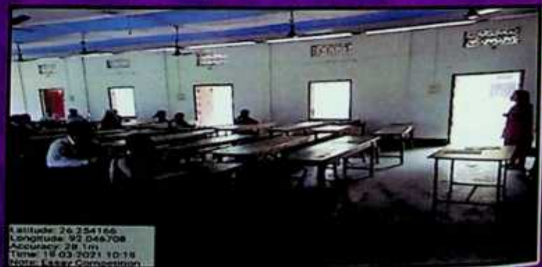
Latitude: 26.254166 Longitude: 92.046708 Accuracy: 2.8.1m Time: 18-03-2021 10:18 Note: Essay Writing Competition

An Essay Writing Competition was held today at Mayang Anchalik College to mark India's 75th Independence Day (#AzadiKaAmrutMahotsav) on 19th March 2021. The competition was held in three groups. Students from Madhya Mayang High School, Sankardev Sishu Niketan, Mayang and Mayang Anchalik College took part in the competition.