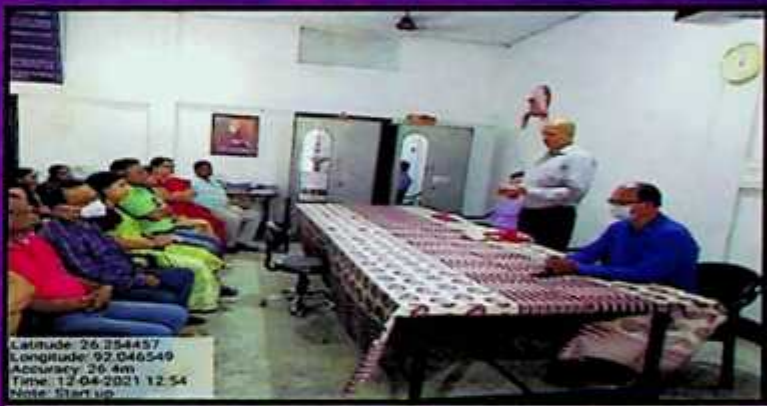
Latitude: 26.254457 Longitude: 92.046549 Accuracy: 26.4m Time: 12-04-2021 12:54 Note: Start up