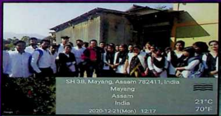
SH 3B, Mayang, Assam 782411, India Mayang Assam India 21°C 70°F 2020-12-21(Mon) 12:17