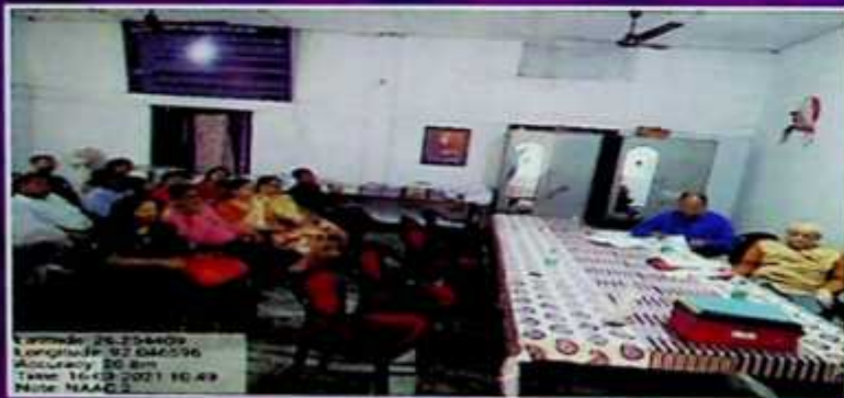
Latitude: 26.254403 Longitude: 92.046596 Accuracy: 20.8m Time: 16-03-2021 10:49 Note: NAAC 2