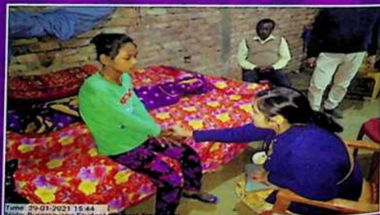
Time: 29-01-2021 15:44 Note: Burhamayong Student