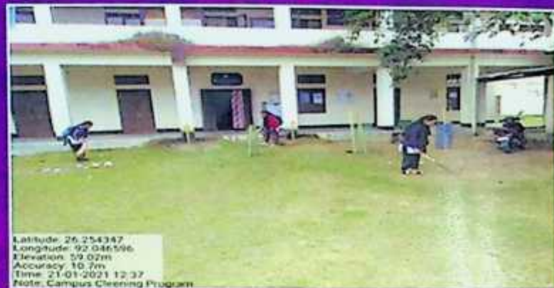
Latitude: 26.254347 Longitude: 92.046596 Elevation: 55.02m Accuracy: 10.7m Time: 21-01-2021 12:37 Note: Campus Cleaning Program

The students of the Mayang Anchalik College had taken this opportunity and initiated cleanliness drive in and outside the college campus on 21st January 2021. During this activity volunteers have cleaned the approach road from Girls Hostel to College Entrance and chopped the unwanted bushes along road side. They also removed the grasses and picked up all the plastic garbage from both sides of the road.