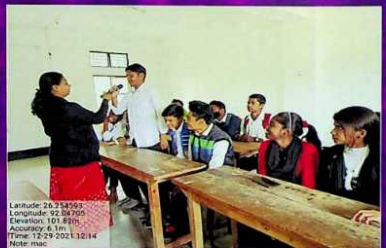
Latitude: 26.254593 Longitude: 92.04705 Elevation: 101.82m Accuracy: 6.1m Time: 12-29-2021 12:14 Note: mac