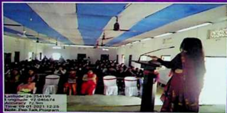
Latitude: 26.254199 Longitude: 92.046674 Elevation: 52.96m Accuracy: 7.25m Time: 09-01-2021 12:25 Note: PEP Talk Program