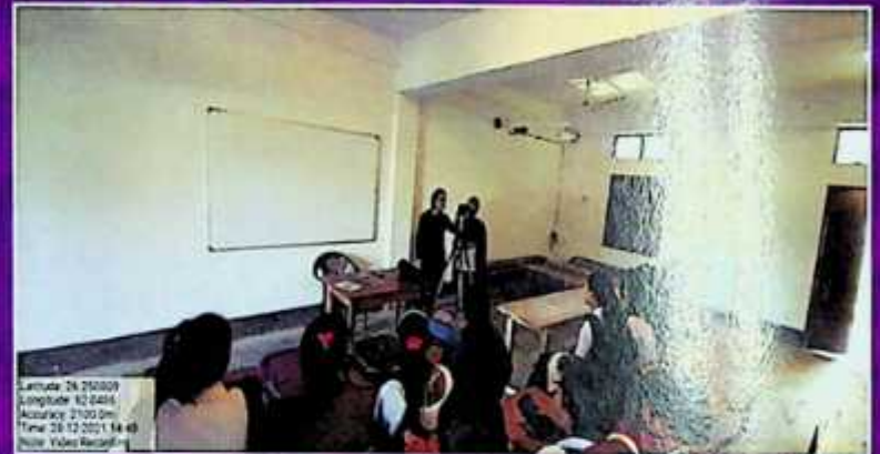
Latitude: 26.250809 Longitude: 92.048599 Accuracy: 21.0000m Time: 28-12-2021 14:49 Note: Video Recording