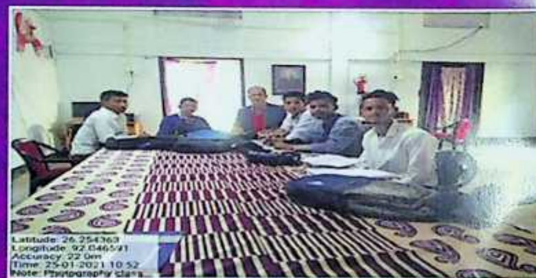
Latitude: 26.254363 Longitude: 92.046591 Elevation: 52.96m Accuracy: 22.5m Time: 25-01-2021 10:52 Note: Photography class