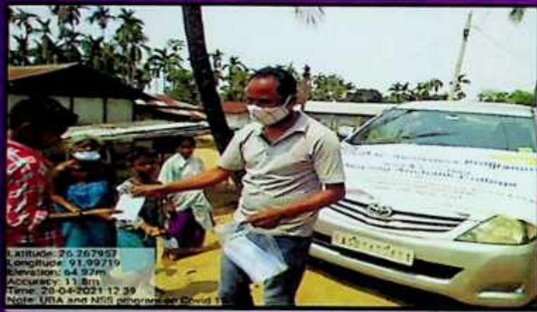
Latitude: 26.267957 Longitude: 91.99719 Elevation: 64.92m Accuracy: 11.8m Time: 20-04-2021 12:39 Note: UBA and NSS programme Covid 19

The UBA and NSS unit of Mayang Anchalik College organized a COVID-19 Awareness Programme in the villages adopted by the college under UBA on 28th April, 2021. The people were made aware about COVID-19 and the necessary precautions to be taken against it. Moreover, the villagers were also distributed face masks by the college authorities.