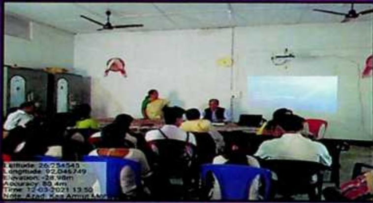
Latitude: 26.254543 Longitude: 92.045749 Elevation: -28.98m Accuracy: 83.4m Time: 12-03-2021 13:50 Note: Azadi Kaa Amrut Mohotsava

Mayang Anchalik College organized a seminar on India's Freedom Struggle and to mark the anniversary of the historic Dandi March of Mahatma Gandhi. This programme was held as a part of the yearlong programme to celebrate India's 75th Independence Day ("Azadi kaa Amrut Mohotsava").