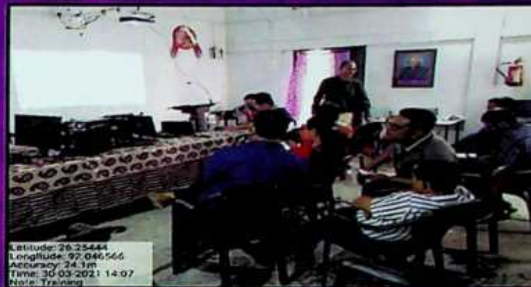
Latitude: 26.25444 Longitude: 92.046566 Accuracy: 24.1m Time: 30-03-2021 14:07 Note: Training