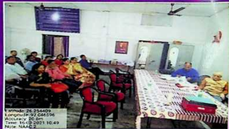
Latitude: 26.254403 Longitude: 92.046596 Accuracy: 20.8m Time: 16-03-2021 10:49 Note: NAAC 2