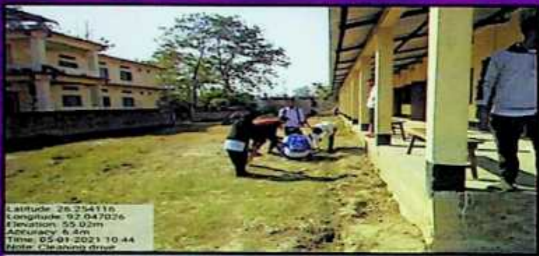
Latitude: 26.254116 Longitude: 92.047026 Elevation: 55.02m Accuracy: 6.4m Time: 05-01-2021 10:44 Note: Cleanliness drive

The students of the Mayang Anchalik College had taken this opportunity and initiated cleanliness drive in and outside the college campus on 5th January 2021. During this activity volunteers have cleaned the approach road from Girls Hostel to College Entrance and chopped the unwanted bushes along road side. They also removed the grasses and picked up all the plastic garbage from both sides of the road.